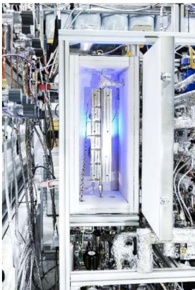
Front view of the reactor with open furnace door. The compact and mobile system is designed for use on location.

The test stand has already been used successfully for DME synthesis. Contrarily to the conventional synthesis, here the reaction in focus takes place in the liquid phase at a moderate reaction temperature, creating new opportunities for process intensification and energy-efficient production using reactive distillation approach under development at Fraunhofer ISE. During the measurement campaign, an unexpected dynamic shrinkage of the catalytic bed occurred with the catalyst under investigation. “Thanks to the fiber-optic measurement technology, the shrinkage was quantified in a time-resolved manner based on the shift in the temperature profile in the reactor and as a result reflected in the modeling precision. This underlines the added value of KISS compared to traditional kinetic test stands,” reports Malte Semmel, doctoral student and KISS plant co-developer in the Group Power to Liquids.