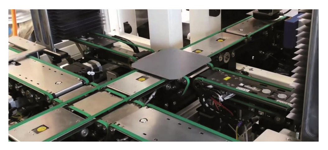
Inline characterization: Wafers are sorted using predefined algorithms or measurement results.