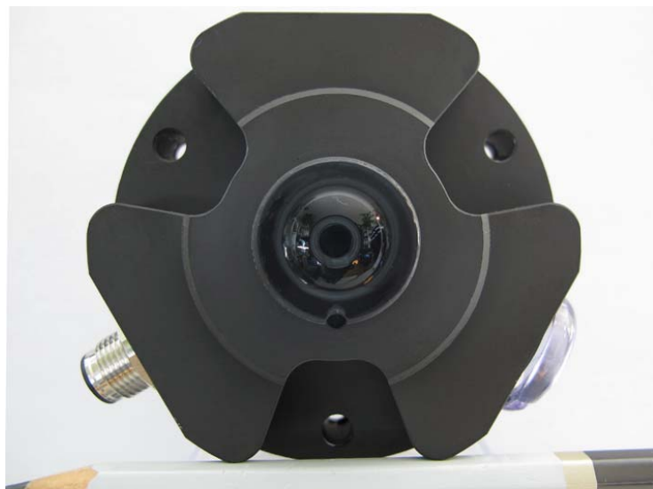
Measurement device to determine sun's position, used to measure the tracker accuracy.

Freiburg April 16, 2012 No. 08/12 Page 4